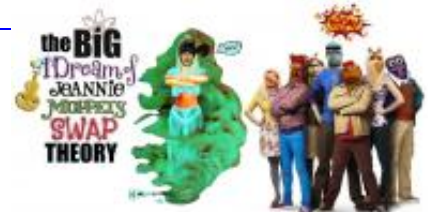
The Three World Reality Crash by Dragondack