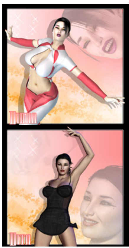
Poser and DS. Does not include Hair or clothing.