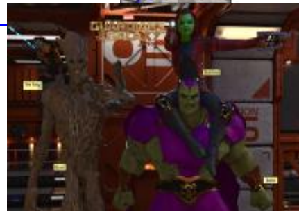
GoTG JR by magnusch