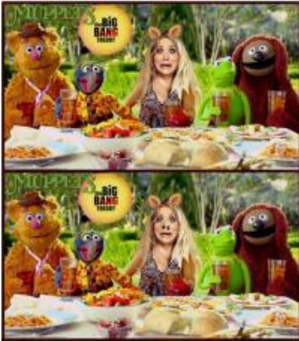
Penny Vs Muppet Casting Party by Dragondack