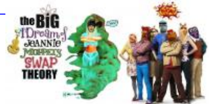
The Three World Reality Crash by Dragondack