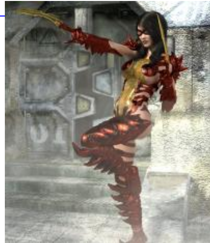
Spider Woman/ Witchblade by Dark Wanderer

Lady Mix-A-Lot Challenge Entries Gallery