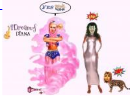
a Different Wonder Woman by Dragondack