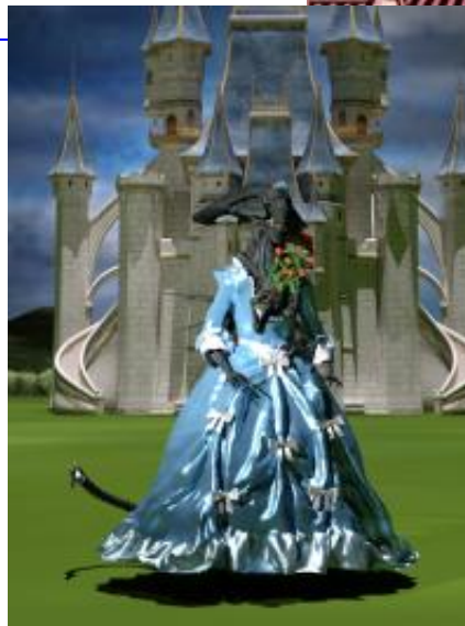
The Latest Princess by Nolen Void