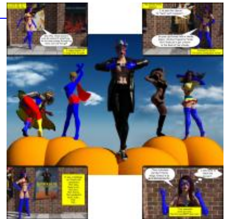
Lady Mixed alot by drunkendragon